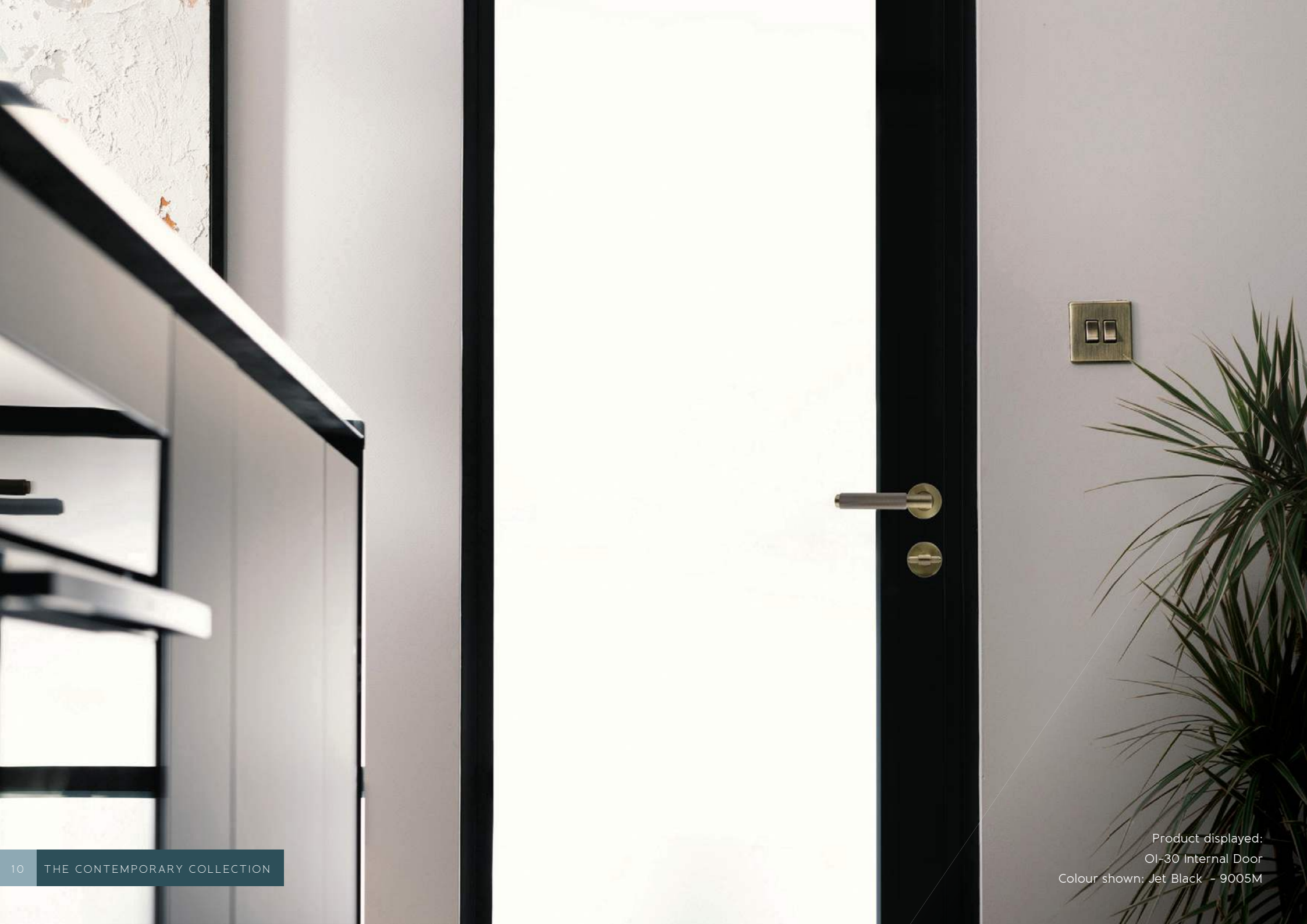
Product displayed: OI-30 Internal Door Colour shown: Jet Black - 9005M